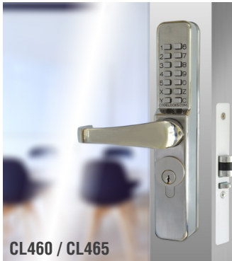
CL460 / CL465