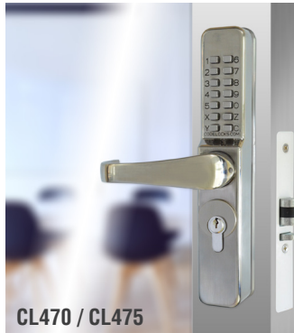
CL470 / CL475

Narrow stile Codelock complete with cams, threaded cylinder and lever handles.